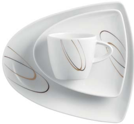
424490 Dekoridee Doublée