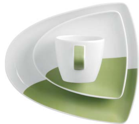
424520 Dekoridee Vela