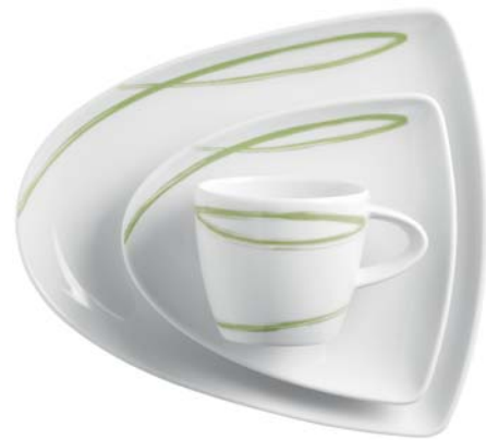
424530 Dekoridee Loom