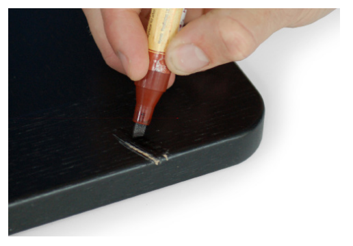
1. Apply dye pen to affected areas