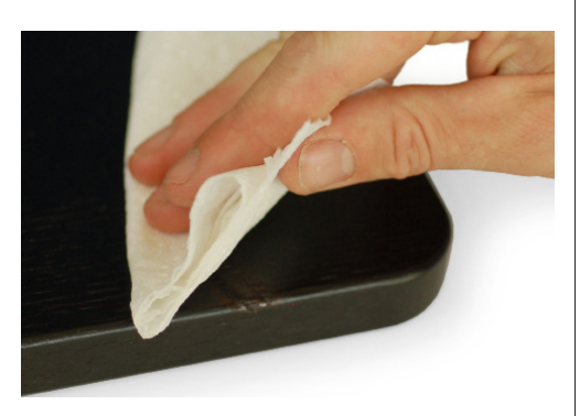
2. Immediately wipe with kitchen towel to remove excess