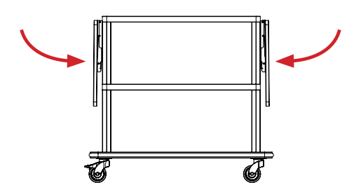
CLOSE SIDES BEFORE MOVING TROLLEY